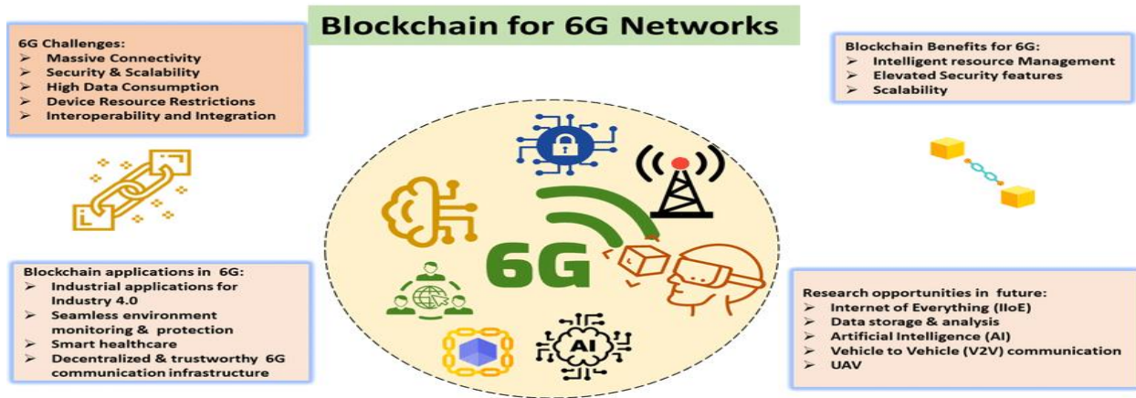
Figure 3. Role of blockchain for 6G networks

This article provides a forward-looking view of the potential of both technologies by examining the combination of blockchain technology with 6G networks in smart healthcare applications [41] [42].