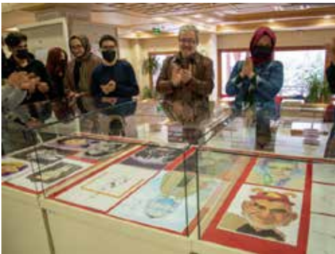
Image 1, https://grafiktasarim.fsm.edu.tr/GRAFIK-TASARIM--Ogrenci-Sergileri-2022--3-Ders-Sergisi

Thanks to television, advertising and the internet, the basic literacy of the 21st century will be visual. It is no longer enough to read and write text. Students must learn to process both words and pictures. They can move fluently between text and pictures, between literal and figurative words (Burmark, 2002).