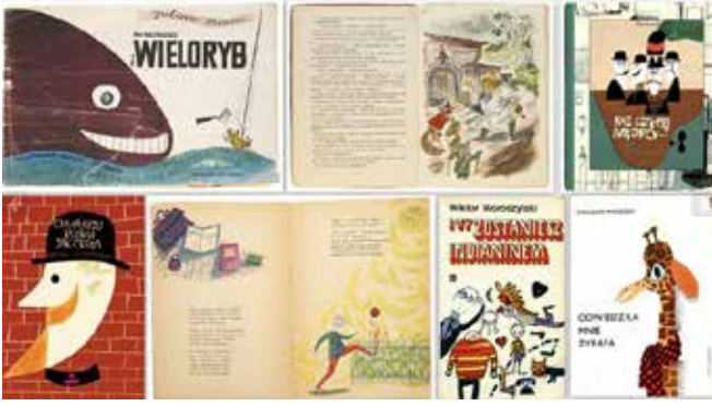
Image 4