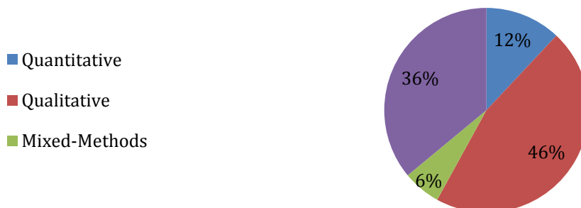
Figure 3. Studies related to research methods

As can be seen in Figure 3, the research methodology followed in the curriculum development demonstrates that the majority of them are qualitative 46%, and the quantitative approach proportion was 12%, while a minor portion of them are 6% mixed-method studies and the proportion of studies that do not have a specific methodology 36%.