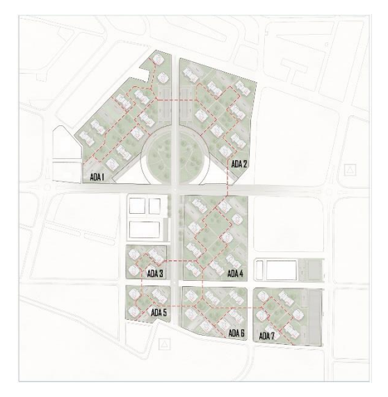
Figure 2: Urban blocks pedestrian circulation axles

The buildings are placed at an angle of 45 degrees in the north-south direction with the aim of getting maximum benefit from the sun and wind (Figure 3). All blocks are placed in accordance with distances between buildings. A square was designed between Urban Block 1 and Urban Block 2, and a human-oriented design approach was adopted with green areas, children's playgrounds and sitting areas (Figure4,5,6). Urban Block 1 and 2 are residential+commercial blocks and these commercials are located at the points overlooking the main square. When the site plan is examined, it will be seen that the open car parks are located on the outer perimeter of the parcels, and no vehicles are allowed inside the area that can be described as a residential site, except for emergencies. The number of parking lots has been determined in accordance with the regulation. Indoor parking lot has been solved in all parcels that exceed 1000 m2 in the urban block parcel. Indoor parkings have been designed according to the fire escape rules and distances specified in the fire regulations.