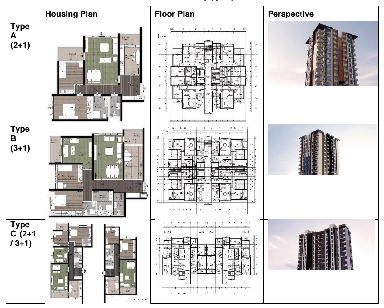
Table 2: Housing typologies

creating different plan types, facade studies (Table3) were also made, and care was taken to develop a common design language.