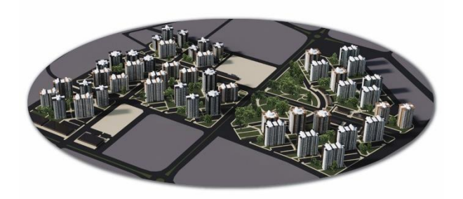
Figure 4: Site plan perspective