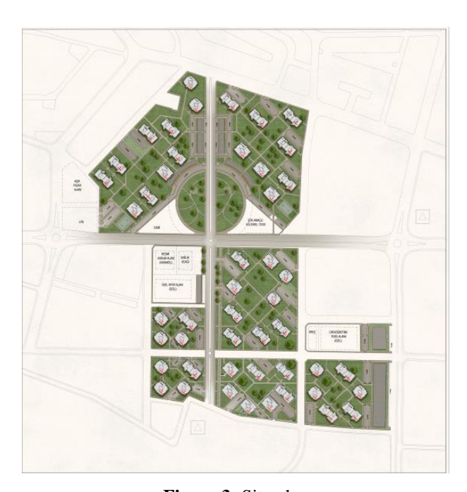
Figure 3: Site plan

The buildings are placed at an angle of 45 degrees in the north-south direction with the aim of getting maximum benefit from the sun and wind (Figure 3). All blocks are placed in accordance with distances between buildings. A square was designed between Urban Block 1 and Urban Block 2, and a human-oriented design approach was adopted with green areas, children's playgrounds and sitting areas (Figure4,5,6). Urban Block 1 and 2 are residential+commercial blocks and these commercials are located at the points overlooking the main square. When the site plan is examined, it will be seen that the open car parks are located on the outer perimeter of the parcels, and no vehicles are allowed inside the area that can be described as a residential site, except for emergencies. The number of parking lots has been determined in accordance with the regulation. Indoor parking lot has been solved in all parcels that exceed 1000 m2 in the urban block parcel. Indoor parkings have been designed according to the fire escape rules and distances specified in the fire regulations.